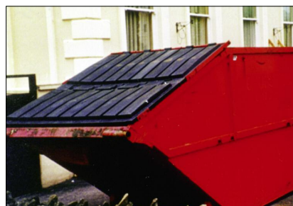
Use a lockable skip for asbestos cement sheet