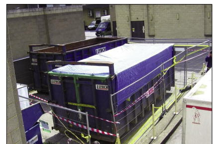
It is not good enough to throw sheeting over a standard skip

This guidance is issued by the Health and Safety Executive. Following the guidance is not compulsory and you are free to take other action. But if you do follow the guidance you will normally be doing enough to comply with the law. Health and safety inspectors seek to secure compliance with the law and may refer to this guidance as illustrating good practice.