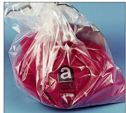
All waste should be double-bagged or double-wrapped in plastic sheeting, with the correct hazard warning signs attached.